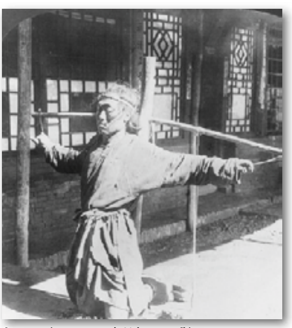
Arm extension torture, early 20th century China.

Much of that doubt, these days, is political. The debate in America about what counts as torture is rarely about what actually happens to the body and more about whether the end, the extraction of vital national security information, is justified. We avoid thinking about what "short shackling" means