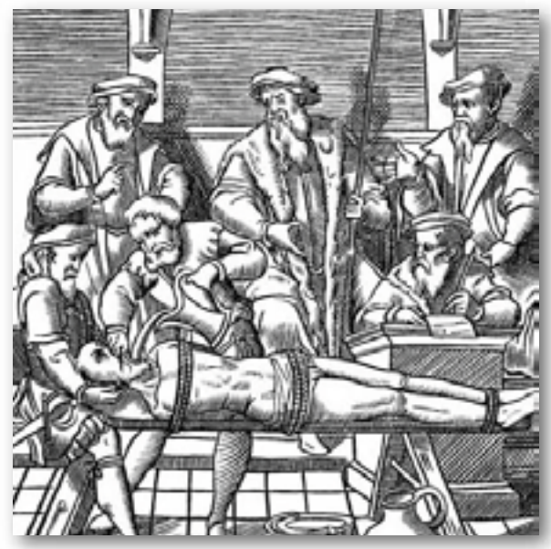
The "water method" torture, common during the Spanish Inquisition.

relied on the state to call it a crime. Europe's major monarchs outlawed heresy, and the church handed over-rendered, one could say-cases of heresy to