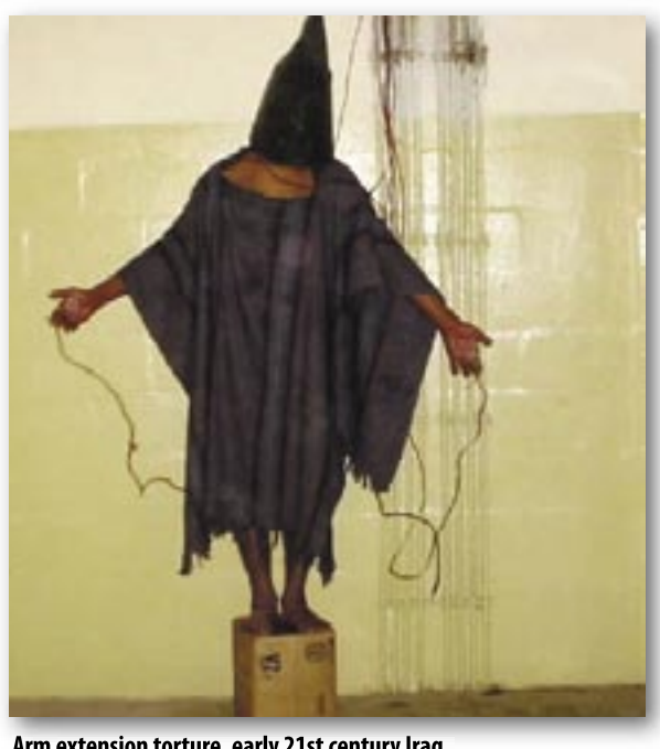
Arm extension torture, early 21st century Iraq.

The cause gives the experience a greater meaning that not only helps people recover from torture, some doctors say, but also to live through it in the first place. It's less about what's felt